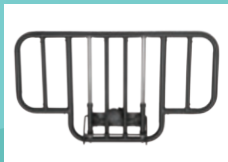
BPR120C Half Length Bed Rail