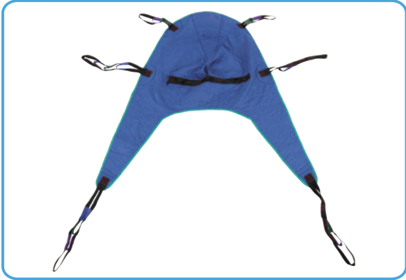
Divided-leg Sling (LPS21)

Costcare provides an extensive range of slings to be paired with the Costcare patient lifts. The variety of slings offer solutions to all lifting circumstances.