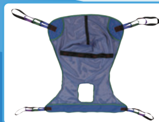
Full Body Mesh with Commode Sling (LPS28)