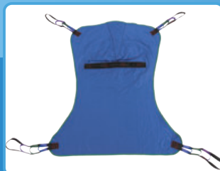
Full Body Sling (LPS26)