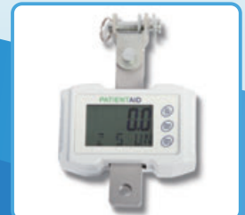
Digital Weight Scale (LPW10)