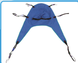
Divided Leg Sling (LPS21)