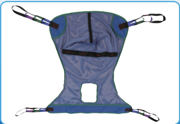
Full Body Mesh With Commode Sling (LPS28)