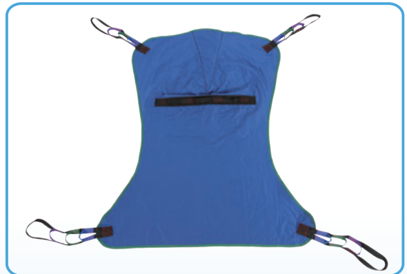
Full Body Sling (LPS26)