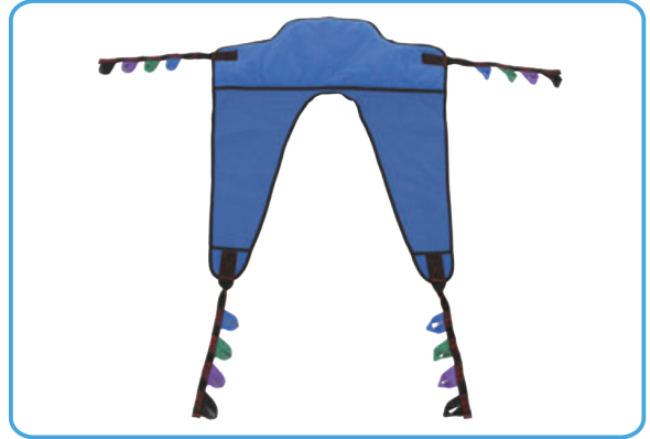
Transfer Sling (LPS23)