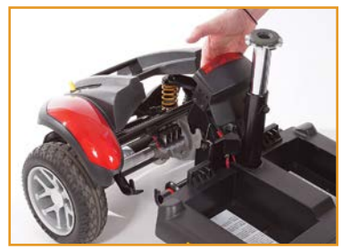
Step 4: Pull forward on the drivetrain release lever to separate the front and rear frame sections!