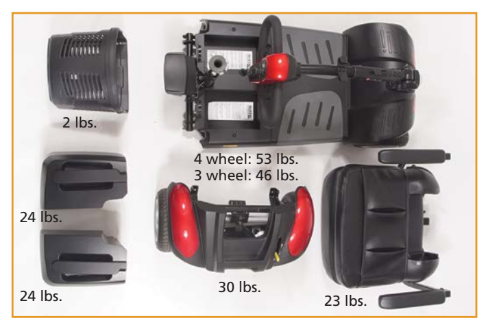
Disassembles into 6 pieces!