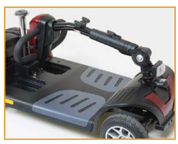
Step 3: Fold down tiller and lock in place!