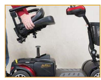
Step 1: Pop off the seat!