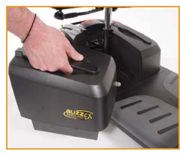
Step 2: Pull out the battery pack!