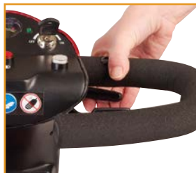
EZ Reach tiller adjustment