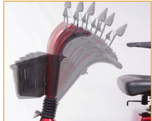
Patented infinite adjustable tiller