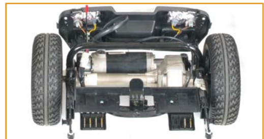
Quiet & maintenance free motor