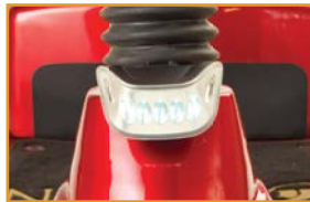
Angle adjustable LED headlight creates a wide path of bright light