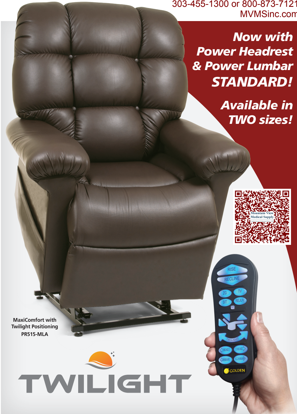
MaxiComfort with Twilight Positioning PR515-MLA