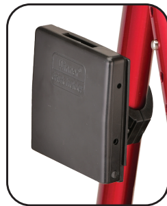
Folds flat when not in use