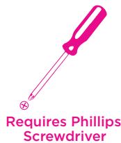
Requires Phillips Screwdriver