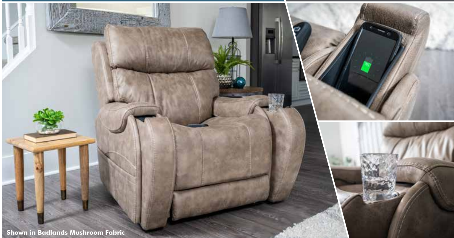
Shown in Badlands Mushroom Fabric