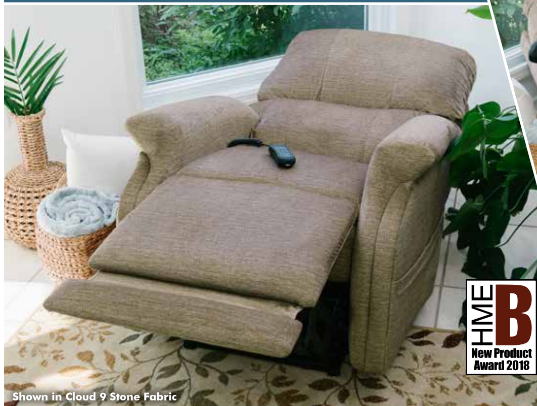
Shown in Cloud 9 Stone Fabric