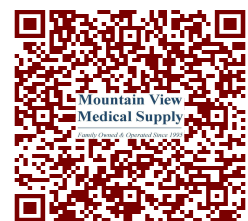
4 Wheel Scooter