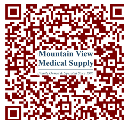
3 Wheel Scooter

Mountain View Medical Supply 5076 W. 58th Ave. Arvada, CO 80002 303-455-1300 or 800-873-7121 MVMSinc.com