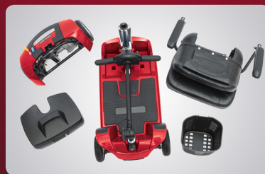
Feather-touch disassembly for quick transport or storage.