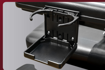
Personalize your Go-Go® with one or more of our optional accessories.

* Only one rear accessory can be used at a time.