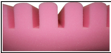
"Varying size cells are cut from a single piece of foam to allow the Curve to conform to the body's natural contour."