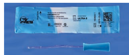
The Cure Ultra and Cure Ultra Plus feature a pre-lubricated straight tip with polished eyelets and 'No-Roll' connector/funnel end.

The sterile, single use Cure Ultra is a ready to use catheter for women. The small package features an easy tear top and enables disposal of minimal material. The catheter features polished eyelets on a pre-lubricated straight tip and a unique, 'No Roll' connector/funnel end. It is ideal when discretion and convenience are important considerations.