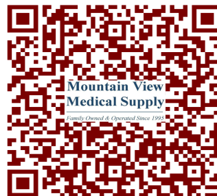
S66 3-Wheel Scooter

Mountain View Medical Supply 5076 W. 58th Ave. Arvada, CO 80002 303-455-1300 or 800-873-7121 MVMSinc.com