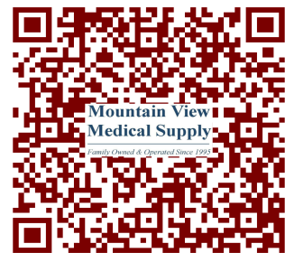
S67 4-Wheel Scooter