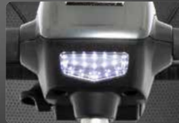
LED headlight in tiller

Experience the Revo® 2.0 , the most impressive mid-size scooter that combines an array of features into one great package. Tough and built to last, the Revo 2.0 offers rugged dependability you expect from luxury mid-size scooters. Comfort-Trac Suspension (CTS) ensures a smooth and comfortable ride over varied terrain. Experience convenient, feather-touch disassembly for portability that is comparable to our Travel Mobility line. Enjoy standard under seat storage and speeds up to 5 mph.