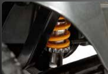
Pride's CTS Suspension