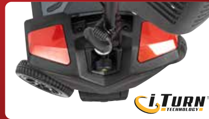
Patent-pending, intelligent-turning, iTurn Technology™

Get the 4-wheel scooter with a 3-wheel turning radius with the Zero Turn 8 (aka Jazzy® Zero Turn) and Pride's patent-pending, intelligent-turning, iTurn Technology™. Navigate tight corners and small spaces effortlessly with a 38.25" turning radius. Illuminate your ride with bright LED lighting. Dual motors and CTS suspension ensure a smooth and comfortable drive.