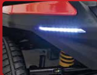
Front LED lights