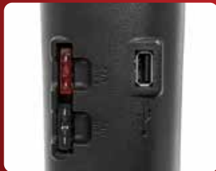
USB charger built into tiller